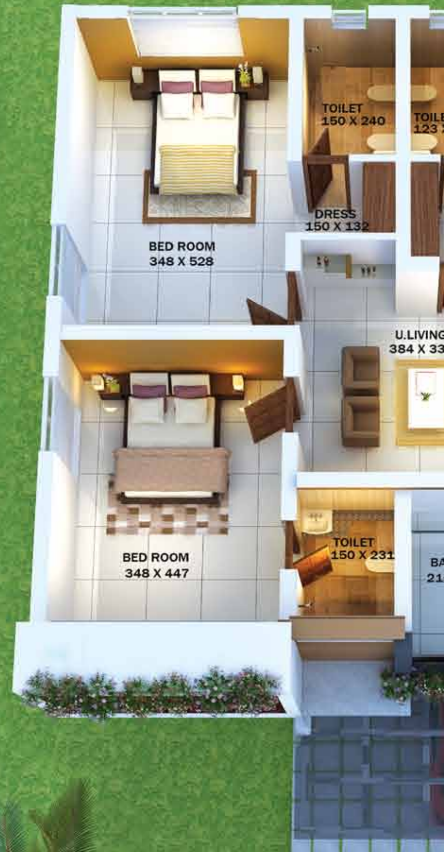
GROUND FLOOR AREA 1160 sqft