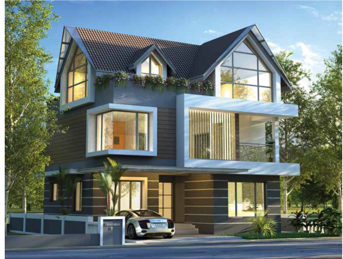
GREENDALE - KAKKANAD