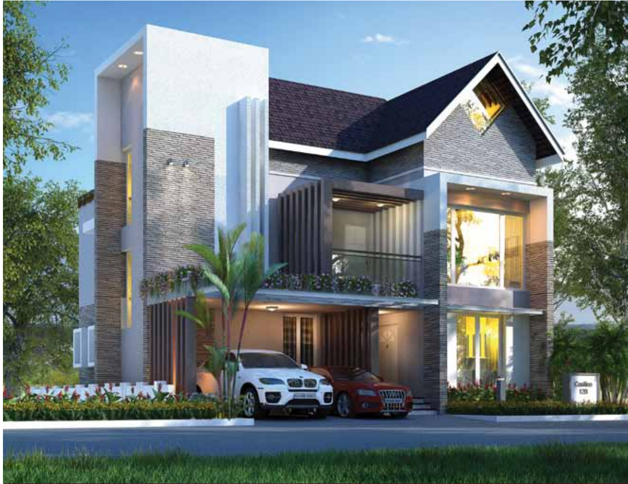
SKYLIFE - INFOPARK, KAKKANAD