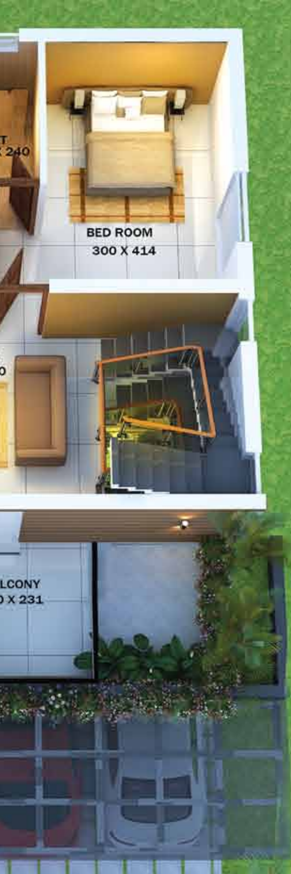
FIRST FLOOR AREA 1097.30 sqft